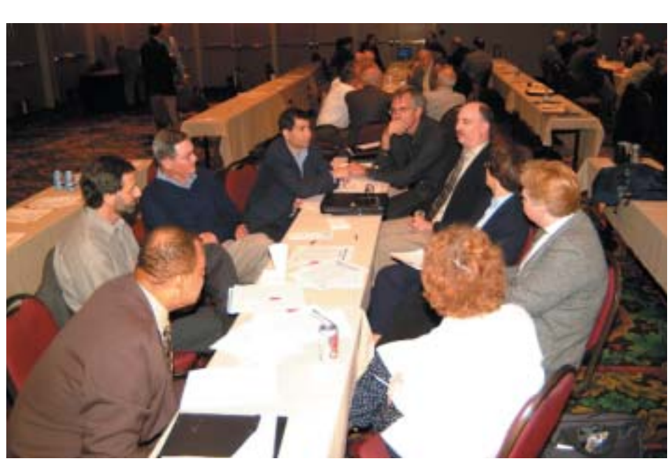
Breakout groups consisted of members of the audience and included representation from APSF, ASA, AANA, JCAHO, SCCM, ACS, CCCE, and our corporate sponsors.