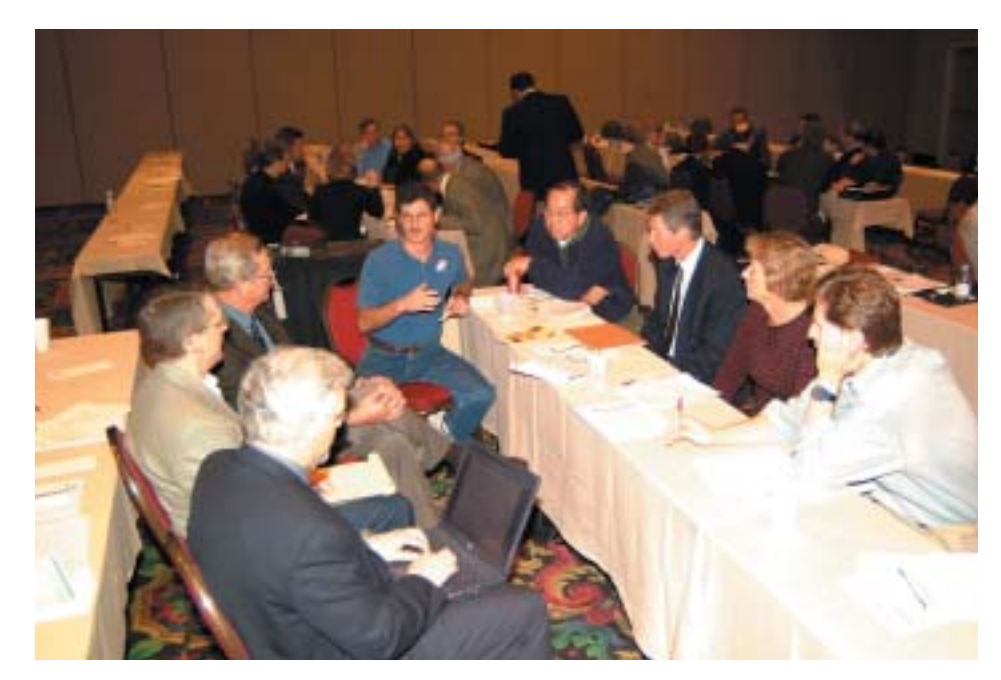
Participants at the 2004 APSF Clinical Alarms Workshop use facilitated small group discussions to help develop recommendations.

The APSF is extremely pleased to announce that, beginning with this issue, the APSF Newsletter will be mailed to all members of the AANA. Thank you to the AANA leadership for making this possible.